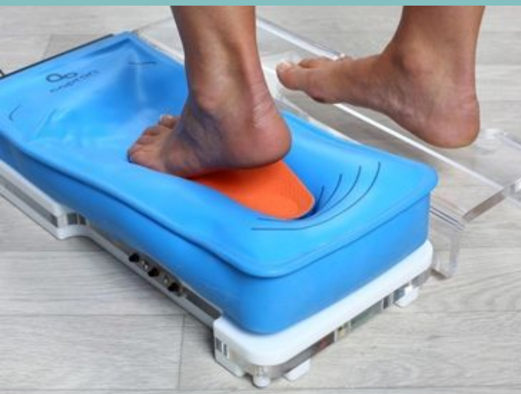
The mould is taken to process the insole